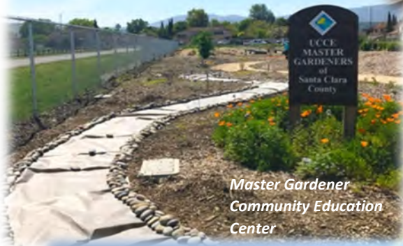
Master Gardener Community Education Center