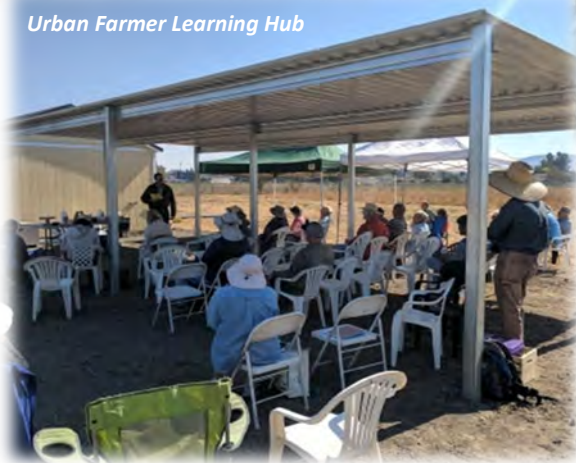
Urban Farmer Learning Hub