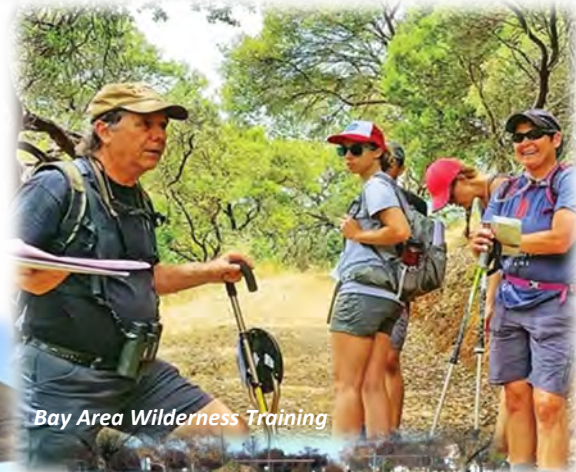
Bay Area Wilderness Training