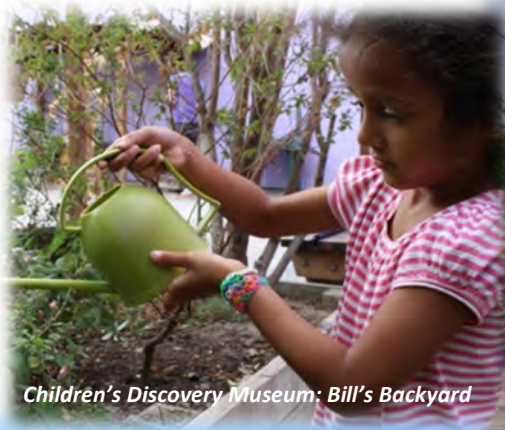
Children's Discovery Museum: Bill's Backyard

As structured by the Expenditure Plan , a grant program would be established, with monies set aside to assist municipalities, schools and applicable non-profit organizations within the cities of Milpitas, Santa Clara, San Jose, Campbell, Morgan Hill and urban County areas to create healthy and safe open space and park areas for their communities. Funds are made available through an annual grant allocation process that is subject to approval by the Authority's Governing Board of Directors.