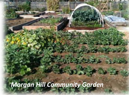
Morgan Hill Community Garden