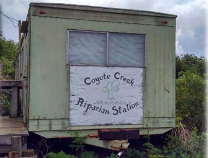
San Francisco Bay Bird Observatory Environment Education Program