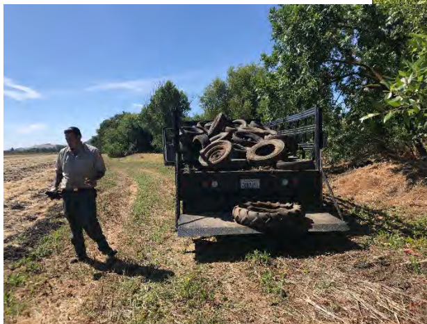
Fisher Creek Riparian Habitat Restoration