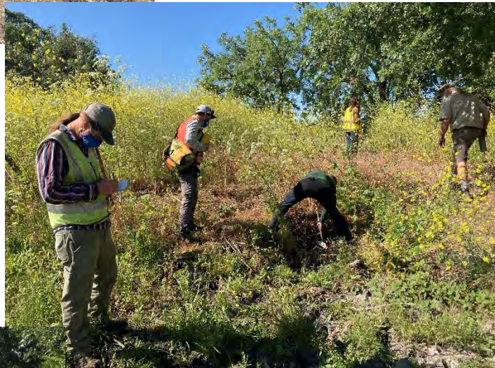
Spreckles Wetland Enhancement Project