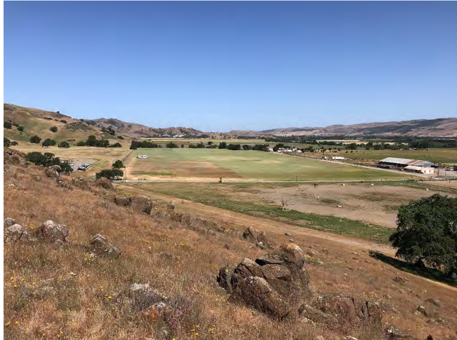
WP Investments - Palm

In this reported fiscal year, the Authority expended $7,832,718 on projects under this category.