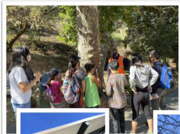
Clockwise starting from the left – Keep Coyote Creek Beautiful’s Community BioBlitz; Guadalupe River Park Conservancy’s Guadalupe Gardens Open Space Protection; City of San Jose’s Guadalupe Oak Grove Park Outdoor Classroom; City of Santa Clara’s Bowers Park Habitat Restoration & Pathway Installation; Living Classroom’s Championing Environmental Literacy in Campbell Elementary Schools; Our City Forest’s Urban Forestry Outdoor Classroom

As structured by the Expenditure Plan , a grant program would be established, with monies set aside to assist municipalities, schools and applicable non-profit organizations, for projects within the cities of Milpitas, Santa Clara, San Jose, Campbell, Morgan Hill and urban County areas to create healthy and safe open space and park areas for their communities. Funds are made available through an annual grant allocation process that is subject to approval by the Authority’s Governing Board of Directors.