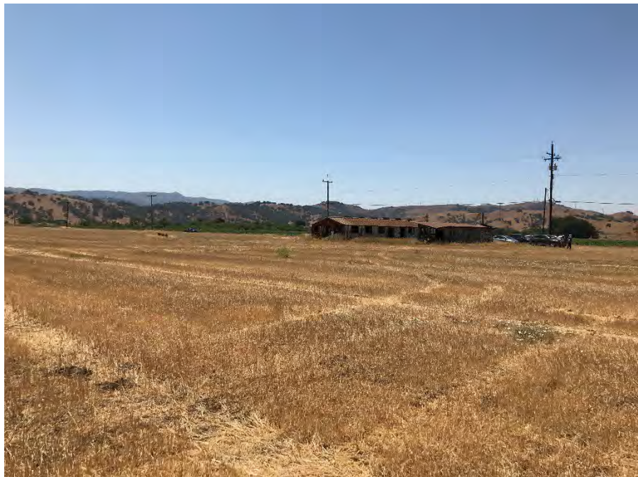
WP Investments - Laguna