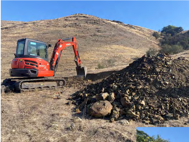
Coyote Ridge Open Space Preserve Grazing and Habitat Improvements

In this reported fiscal year, the Authority expended $200,716 on projects under this category.