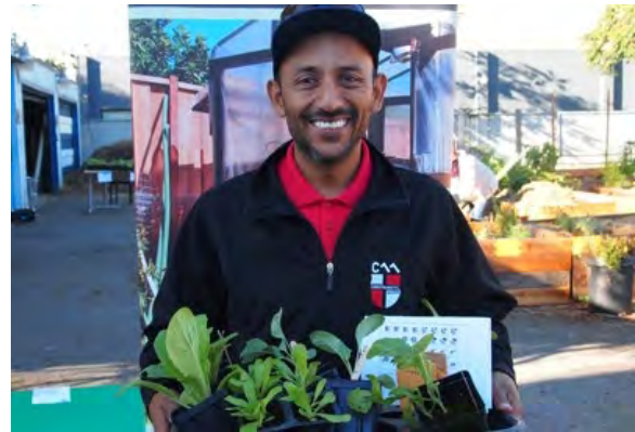
Valley Verde: San Jose Home Gardens

Each fiscal year, the Authority may set aside up to 25% of the parcel tax revenue received from Measure Q and Measure T to fund the grant programs. These allocations are earmarked as restricted funds and made available for the next grant cycle. The Authority's Board of Directors solicits applications and approves the grant awards . The Authority records and reports the disbursement when payment is made to reimburse the grantee.