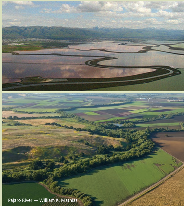
Pajaro River — William K. Mathias

However, unlike built capital, Santa Clara County's significant natural capital is largely self-sustaining and its ecosystem services will likely appreciate or increase in value over time. When calculated as non-depreciable assets, the County's natural capital asset value is between $162 and $386 billion . By comparison, the County's total assessed property value is approximately $335 billion . Valuation of natural capital and ecosystem services dispels the assumption that nature has little value. It remains a challenge to monetize all of the ecosystem services a landscape provides, but through this and future efforts, we can better account for the value of natural capital to society.