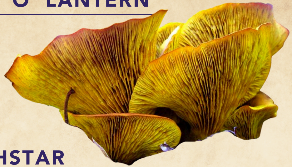
WESTERN JACK O' LANTERN